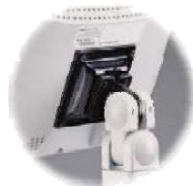
VESA standard Wall Mount 75x75mm