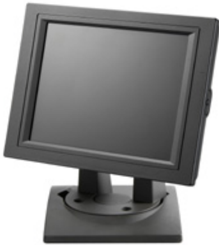
PA80A with add-on-base